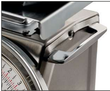
Optional carrying handle