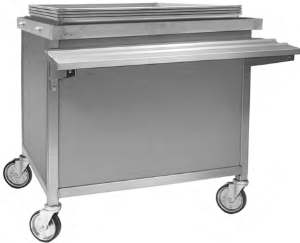
#DCS2020RD tray dispenser unit shown with optional tray slide

Eagle Director's Choice® Rack / Tray Dispenser Unit, model _____. Top to be 16/304 stainless steel turned down on all sides. 1½" square type 304 stainless steel all-welded tubular base. Quick release spring loaded docking device keeps adjoining units together. Self-leveling dispensers furnished (specify tray size). Fully mobile with 5" poly casters, two with brake. Standard laminate panel is holly berry red (Wilsonart® #D307-60).