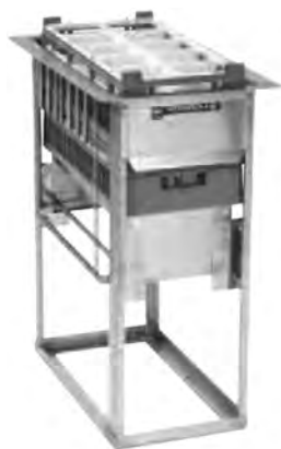
#383390 drop-in dispenser

Factory-installed. 28 3/4" (718mm) overall height.