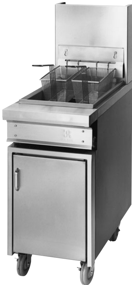
JTFF-40-18 with stainless steel riser