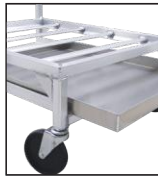
Removable Drip Tray