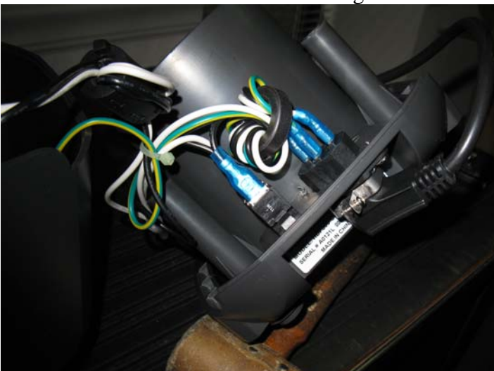
Figure 2. Cord and circuit breaker switch.