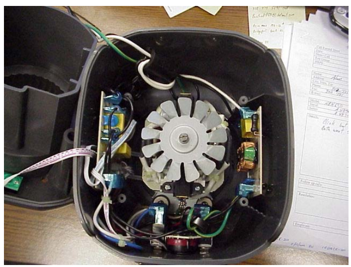
Figure 1. Machine interior.