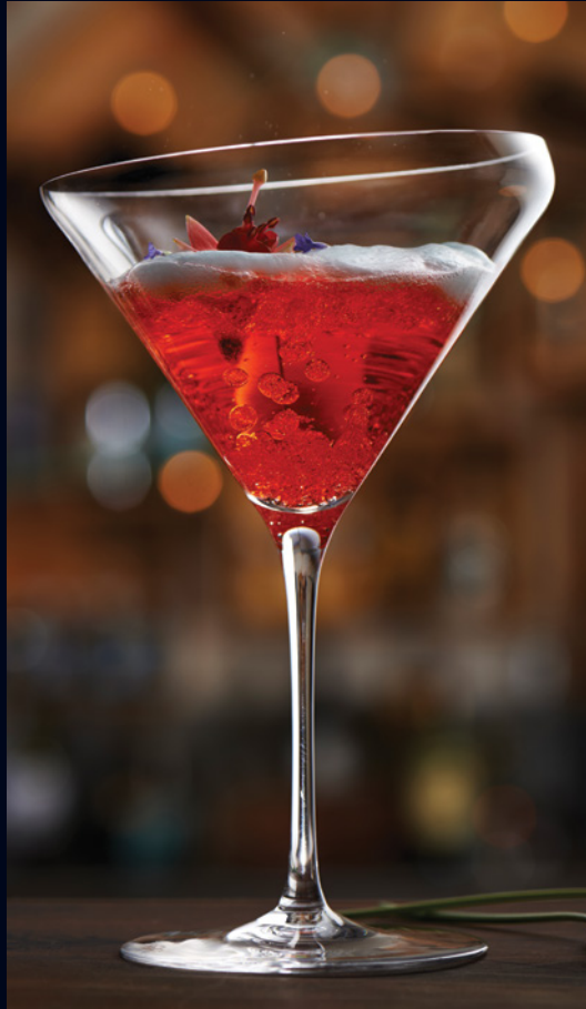
4818R378 Martini (10 oz)