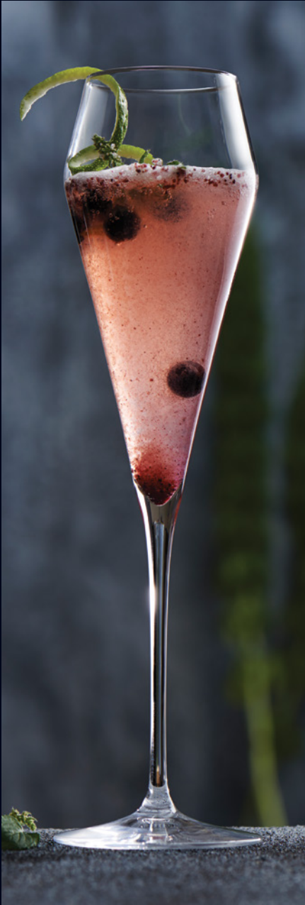
4818R377 Champagne Flute (7 1/2 oz)