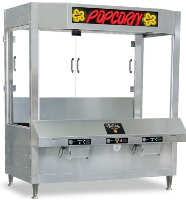
Countertop ReadyServe Model 2785 (000)