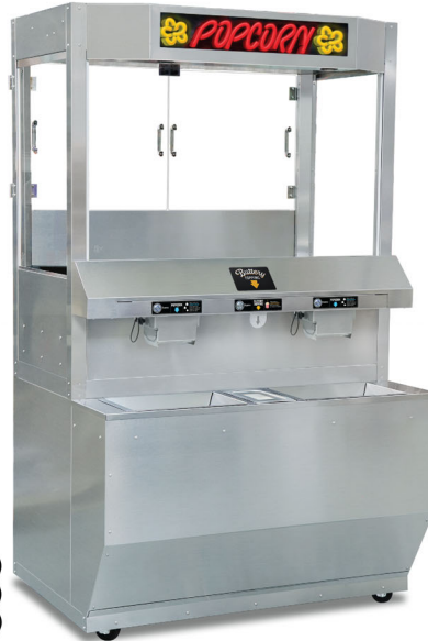
ReadyServe Model 2785 (000) on Base Model 2779 (010) (Base sold separately)