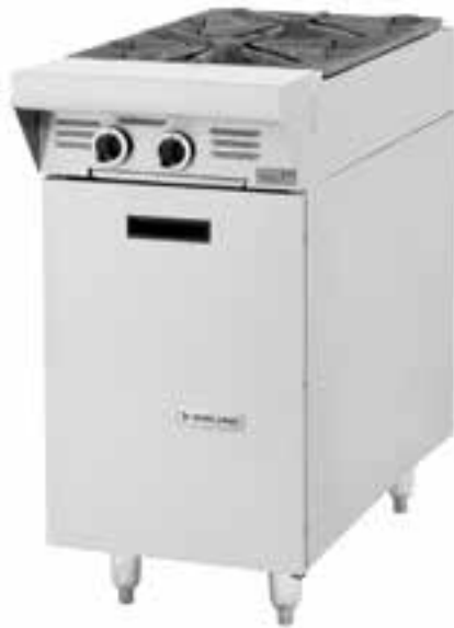
Model M4S 17" Range Attachment With 2 Open Burners