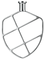
WSM7LMP Stainless Steel Mixing Paddle