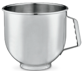
WSM7LBL 6.6 Liter Stainless Steel Bowl