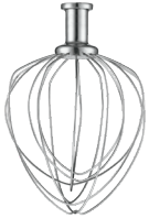
WSM7LW Stainless Steel Chef's Whisk