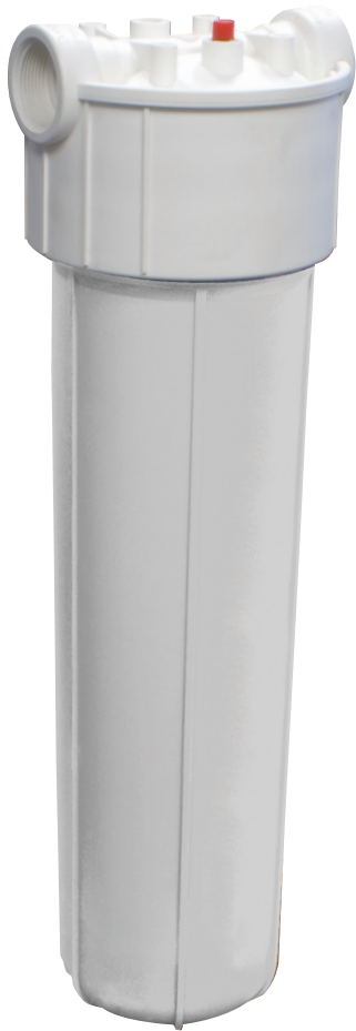
CC-420 Chloramine Carbon System

Increase the quality of your water with the CC-420 Chloramine Carbon System from VIZION™. Designed for use by itself or after a VZN ultrafiltration system, the CC-420 reduces chloramines and removes objectionable tastes and odors.