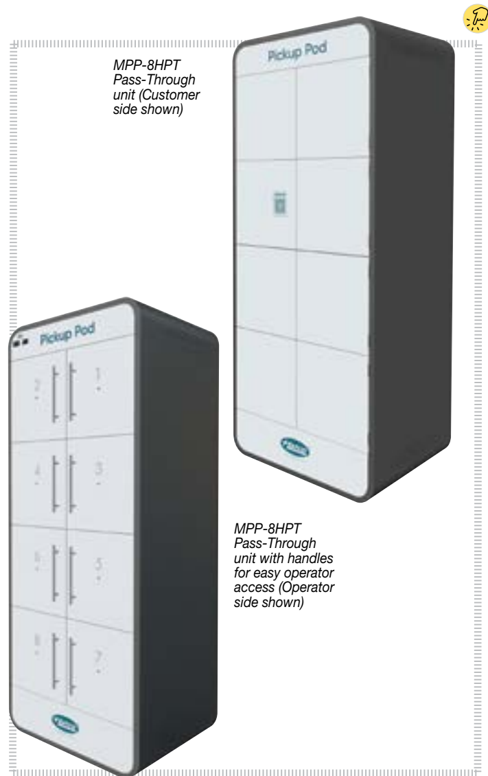
MPP-8HPT Pass-Through unit (Customer side shown)