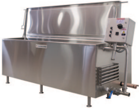
Model shown HBC75