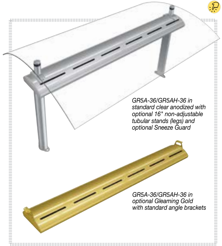
GR5A-36/GR5AH-36 in standard clear anodized with optional 16" non-adjustable tubular stands (legs) and optional Sneeze Guard