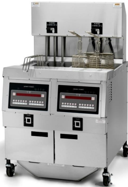
OGA 322 2-well gas auto lift open fryer

OGA 321 1-well gas OGA 322 2-well gas OGA 323 3-well gas