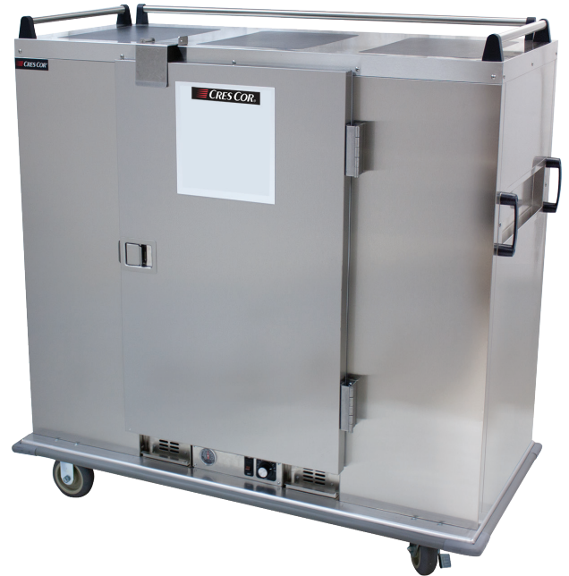
EB-150A (Shown with accessory options)