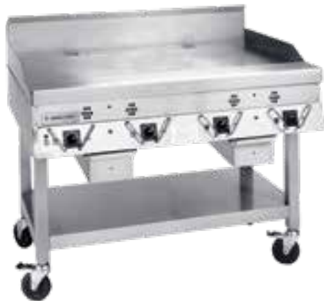
Model ECG-48R (Shown on optional stand)