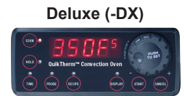
Deluxe Controls are available with 18 programmable menus and 3" meat probe.