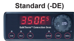
All Ovens come standard with easy-to-read and operate LED digital controls.