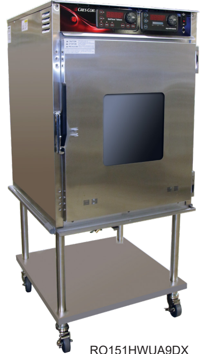
RO151HWUA9DX (shown with option window and stand)