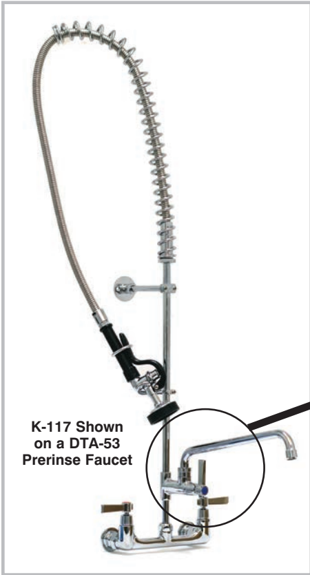
K-117 Shown on a DTA-53 Prerinse Faucet

For Use With DTA-53 Prerinse Faucet Only Conforms To NSF 61/9 Lead Free Requirements