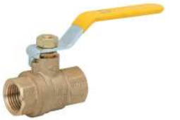
Female Water Supply 1/2" Threaded Ball Valve