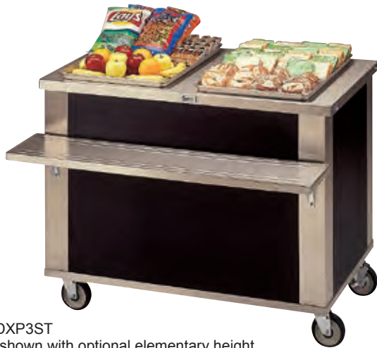
DXP3ST (shown with optional elementary height solid tray slide and formica finish)