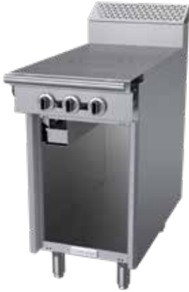
Model C18-10S 18" Add-A-Unit Front-Fired Hot Top