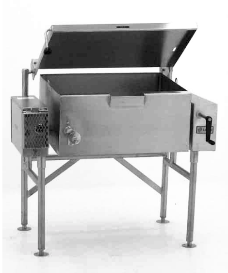
Model TES-2440-9 with optional locking control cover and 1 1/2 draw-off valve