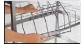
Removable dome cradles hold 10 domes each.