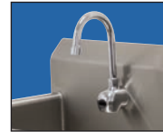
K-175 Electronic Faucets Included On All "EF" Models