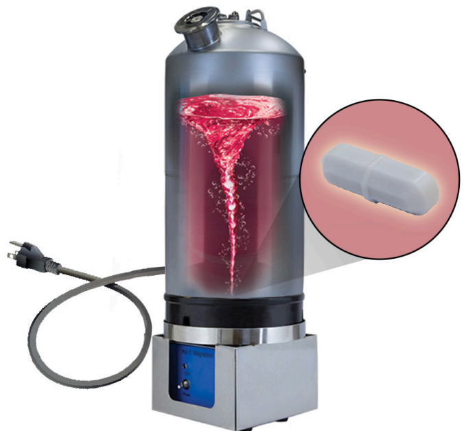
B-18-2 Beverage Tank™ SOLD SEPARATELY