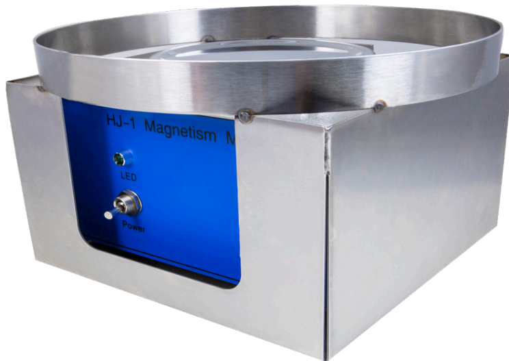
SS-7780-2 9.28" Diameter Holder