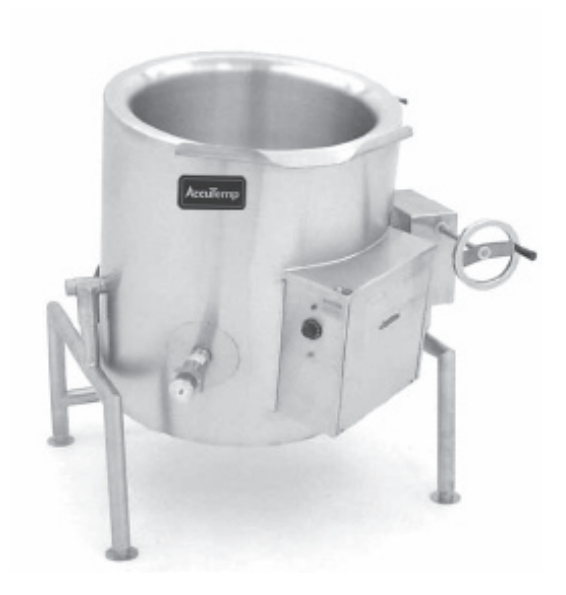
Model ALTWE-60 (shown with optional 1 1/2 draw-off valve)

AccuTemp Edge Series tilting floor-mounted kettle, model ALTWE-XX (20, 30, 40, or 60 gallon capacity), seamless deepdrawn 316 kettle liner (up to 40 gal, 304 liner for 40+ gallon) with integrally formed radius lip and 304 stainless kettle jacket. Full body insulation between the kettle jacket and outer casing. 2/3 jacketed with pressure relief valve, pressure gauge, jacket-water fill valve, automatic low water cut off and indicator light and field replaceable heating elements. Seam welded control console with thermostat temperature control, 150°F to 260°F (65°C to 140°C).