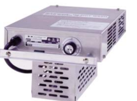
HIGH PERFORMANCE HEATER... Blower system for fast heat up, recovery and even heat distribution throughout cabinet. Unit is removable without tools for easy cleaning.