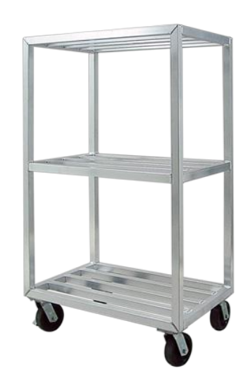
H.D. Series Three Shelf Unit w/ Optional "M6" Casters Casters are factory installed only.

All Welded Heavy Duty Shelving is ideal for correctional facilities, supermarkets, hotels and institutions. With a one-ton weight capacity and heavy duty, bar style shelving, these units are built to organize large, heavy boxes and items.