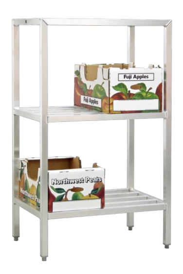
H.D. Series Three Shelf Unit