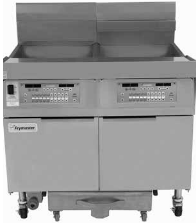
FPLHD265 with 3000 controller and front oil disposal.