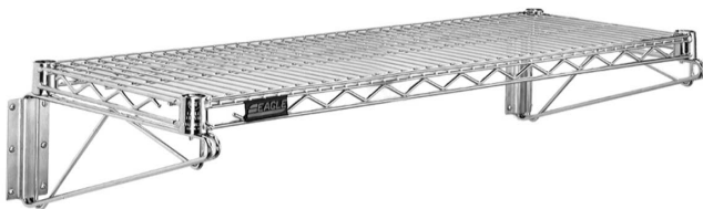
#GWB1436C wire wall shelf kit