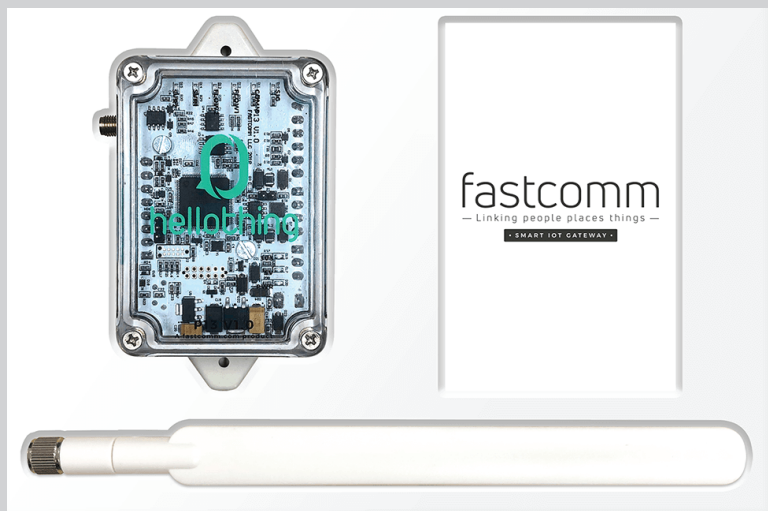
(Gateway for cuber ice machines)