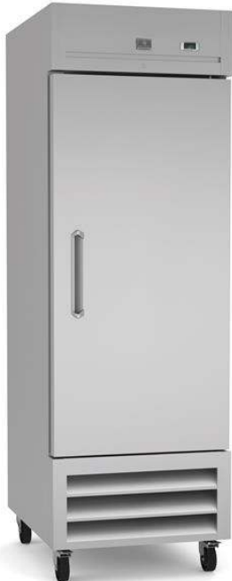
738241 (KCHRI27R1DRE) 1-Door Full Height Refrigerator 27" Long