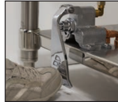
Foot Valves Included On All "FV" Models