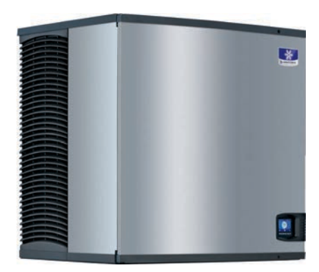
IT1200C Ice Cube Machine - 115V