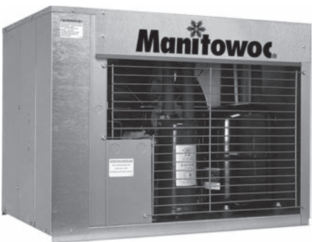
CVD Condensing Unit - 230V