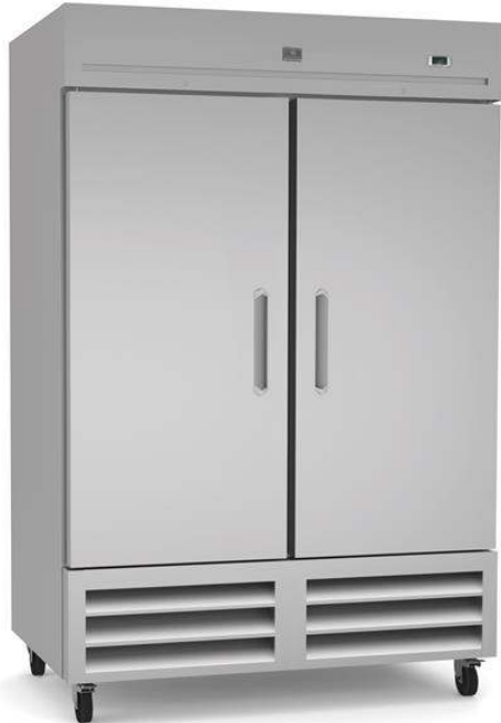
738245 (KCHRI54R2DFE) 2-Door Full Height Freezer 54 " Long