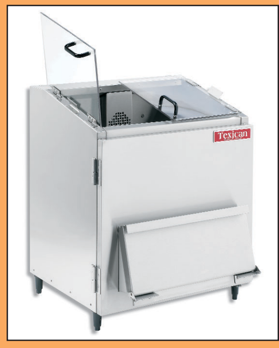
The lower access door opens to form a shelf, easing the serving of chips into baskets and reducing breakage.