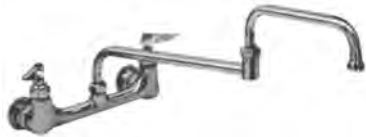
19" (483mm) double-jointed spout faucet