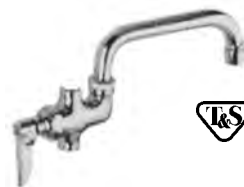
T&S prerinsing faucet add-on

EAGLE GROUP 100 Industrial Boulevard, Clayton, DE 19938-8903 USA Phone: 302-653-3000 • Fax: 302-653-2065 www.eaglegrp.com