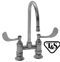
T&S wrist handle faucet