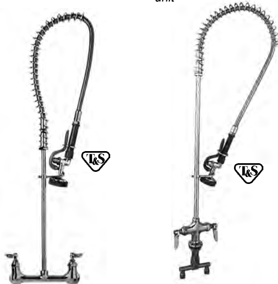
T&S splash mounted prerinsing spray unit