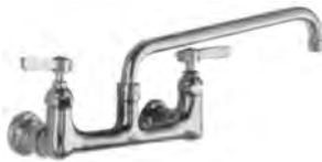
12" (305mm) heavy duty faucet