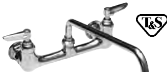
12" (305mm) T&S faucet