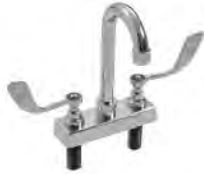
standard wrist handle faucet