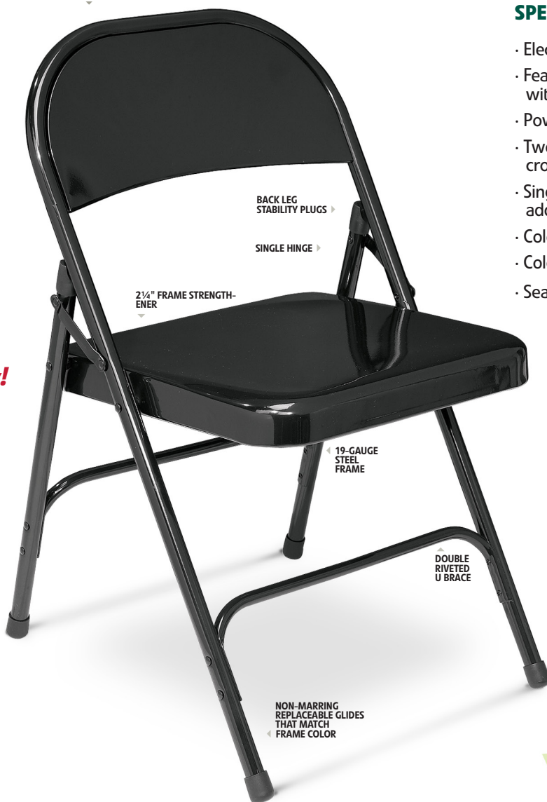
MODEL 510 SHOWN

products meet or exceed applicable ANSI/BIFMA standards