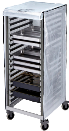
GBCTUGNPR21 Optional Heavy Duty Vinyl Cover for GN 2/1 Full Size Trolley.