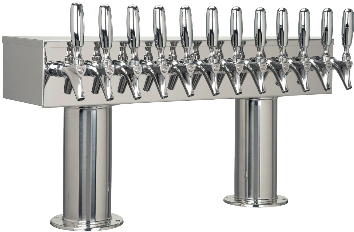
DPT412PSSKR-3 Polished Stainless Steel