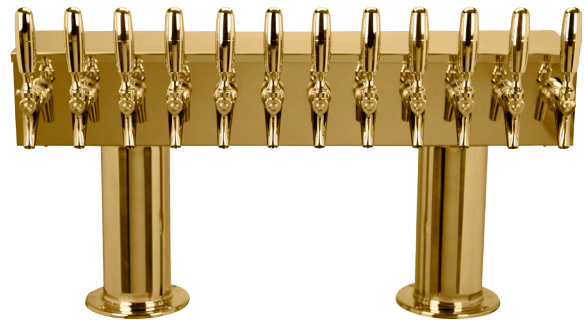
DPT412PVDKR-3 PVD Brass