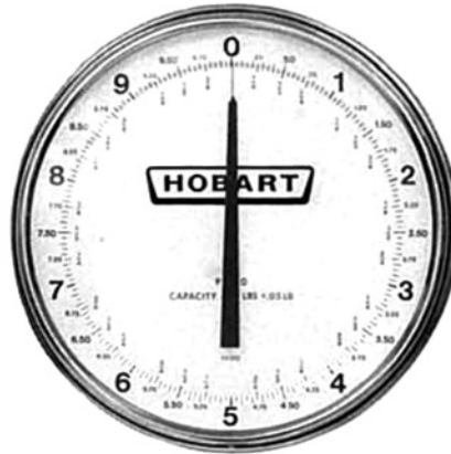
30# x .05 lb. Maximum Capacity 30 lb. Device No. PR30-2