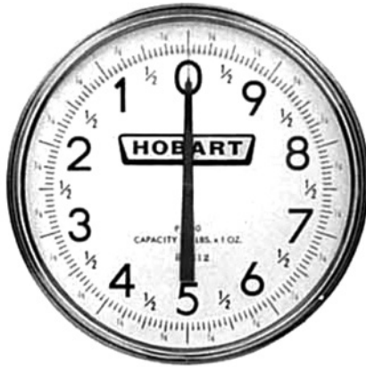
30# x 1 oz. Maximum Capacity 30 lb. Device No. PR30-1