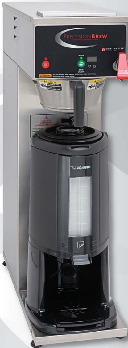
Model B-SGP (Container sold separately)

Digitally controlled gravity container brewer holds brew temperature to \pm 1^{\circ}\text{F} throughout brew cycle. Brew temperature, brew volume, operator defined pre-infusion/pulse brewing, and low temp/no brew are programmable from the front display.