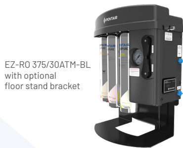
EZ-RO 375/30ATM-BL with optional floor stand bracket