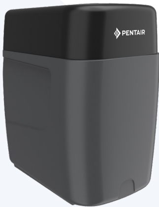
30-gallon atmospheric tank