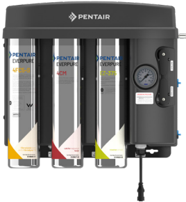
EZ-RO 375/30ATM-BL wall mount