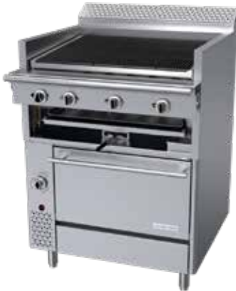
Model C36-ABR Range with 36" Broiler with Adjustable Racks