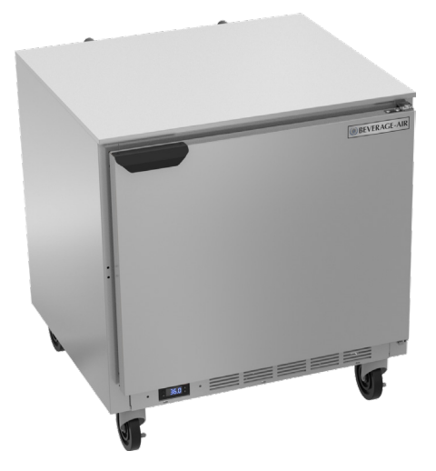
Note: Shown with optional full electronic control