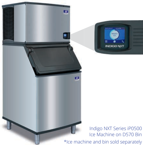
Indigo NXT Series iP0500 Ice Machine on D570 Bin *Ice machine and bin sold separately

Designed for operators who know that ice is critical to their business, the Indigo NXT Series ice machine's preventative diagnostics continually monitor itself for reliable ice production. Improvements in cleanability and programmability make your ice machine easy to own and less expensive to operate.