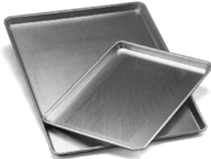
full size solid pan and half size perforated pan