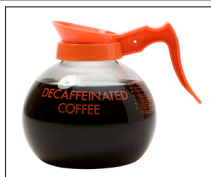
70280200406 64 oz. Glass Decanter - Decaf