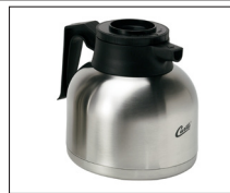
CLXP6401S000 64 oz. Stainless Steel Pourpot