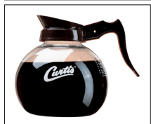
70280000306 64 oz. Glass Decanter - Regular