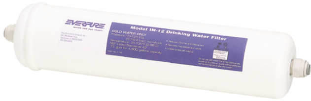
IN-12 with 1/4" JG fittings: EV9100-86

Designed for superior taste and odor reduction