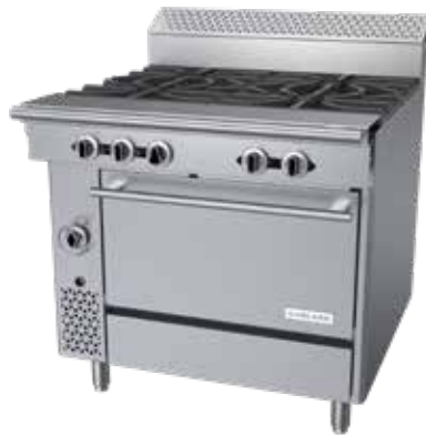
Model C36-7R Range with Four 18" Open Burners